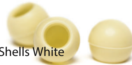
Truffle Shells White