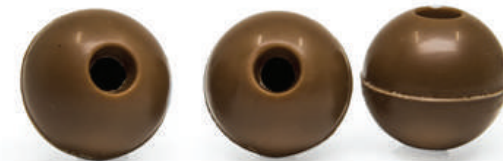
Liquid Shells Milk