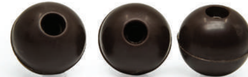
Liquid Shells Dark